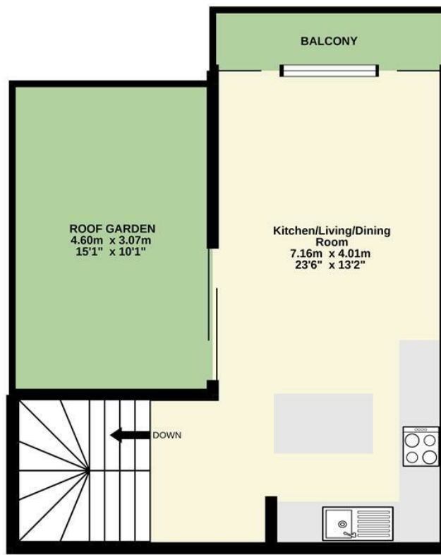
1ST FLOOR 36.4 sq.m. (392 sq.ft.) approx.